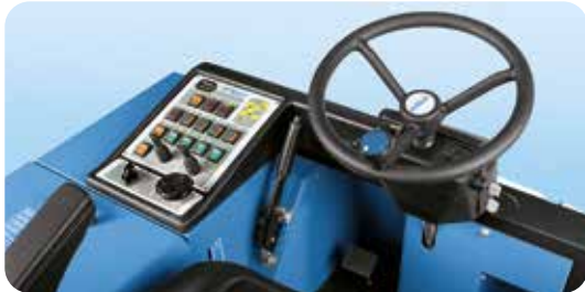
DASHBOARD OF THE BATTERY-POWERED VERSION